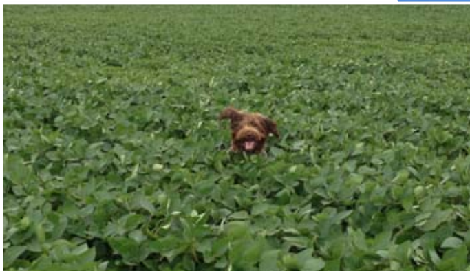
The Beyer family's dog, Stella, peeks through the soybean canopy as they check their fields in Wheaton, Minn.